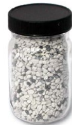
HPE Series Magnetized zeolite absorbs polar formulations