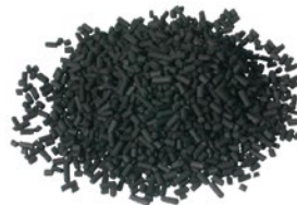
HGS Series Pelletized activated carbon adsorbs trace lubricants