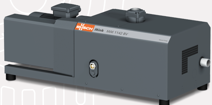
Mink MM 1142 BV

Mink – efficient and reliable vacuum generation.